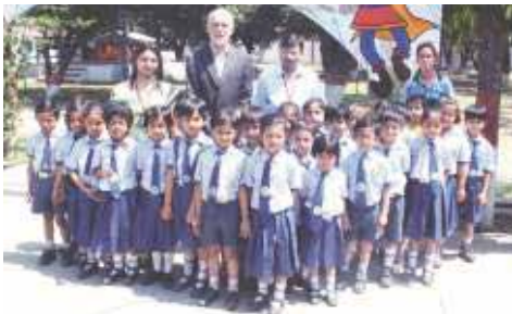
Dr. K.N. Modi Global School Students interacting with the Foreign Delegation on their visit to the School