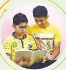
FINE AMBIENCE FOR HOSTELLER