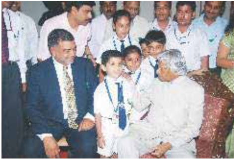
Dr. K.N. Modi Global School Students interacting with Late. Dr. A.P.J. Abdul Kalam Ex-President of India during his excellency visit to the Dr. K.N. Modi Foundation