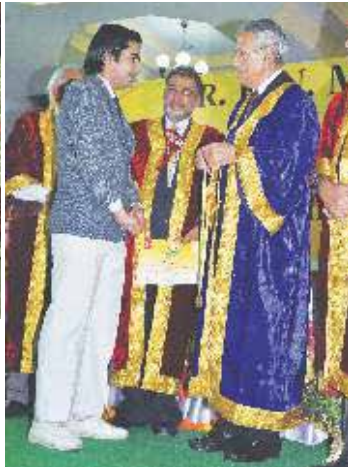
Topper of Dr. K.N. Modi Global School Students being awarded by Late Sh. B. L. Joshi, then the Governor of Uttar Pradesh